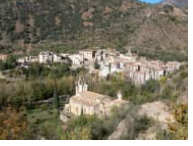
The church and the valley of Gerri de la Sal

12. The return to the Reig main road is along one of the stream's banks. En route, on the left, we can see the other face of El Cabanot and the useful plants garden.