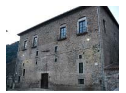
The Alfolí (salt warehouse) at Gerri de la Sal

Description: Linear excursion that crosses the main road and leads deep into the salt beds area of Sant Antoni.