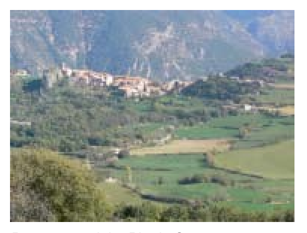
Peramea and the Pla de Corts

2. Village declared a "Cultural Asset of National Interest" owing to the important and varied heritage preserved there. In the square where cars can be parked, highlights are the centuries-old elm and the public washing trough that is still used today. Around the village itself other highlights include: its mediaeval structure in the form of a closed town (the exterior facades of the houses act as the area's surrounding walls), the covered street of Sant Cristòfol, the church of Sant Cristòfol (14th century), the Roca del Castell above the church (the rock upon which the old castle stood and which offers a sweeping view of the Pla de Corts and surrounding area), the forge, the Portal de Llevant gateway (13th century) and some of the houses on Carrer Major (Casa Parramon and Casa Agnès); a visit to the first of these is especially recommended, it is an authentic rural house.