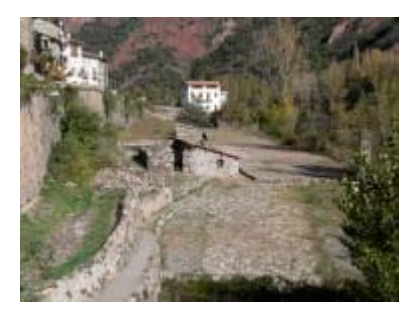
The El Roser salt beds and the Mola (power station) in the background

4.1. A path exits the car park entrance in an upriver direction and leads to the southern area of the old El Roser salt beds. This path was used to take the salt from the salt beds to the Alfolí (salt warehouse).