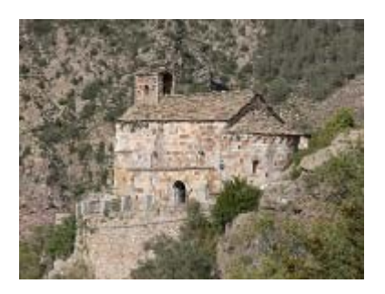
Mare de Déu d'Arboló Sanctuary

4.1. The route can be lengthened 250 m further to the north, by descending to the hanging wooden bridge (604 m) which leads to the N-260, upriver of Gerri.